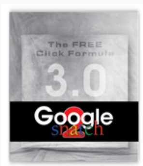
The Free Click Formula 3.0