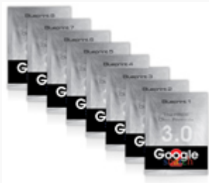
8 Step by Step Blueprints